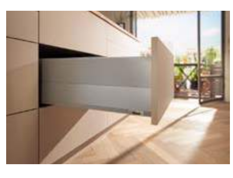
Experts consistently opt for metal: it accentuates the clear cut design.