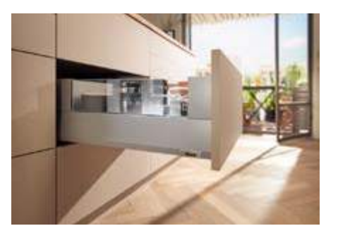
MERIVOBOX modular with BOXCOVER MERIVOBOX modular with BOXCAP Glass design elements capture the light and create a classy impression.