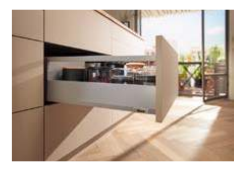
MERIVOBOX modular with gallery The high fronted pull-out option with a gallery is eye catching and a top quality, entry-level solution.

Drawer side height M is a true all-rounder as a drawer, but also as a base for all high fronted pull-out options.